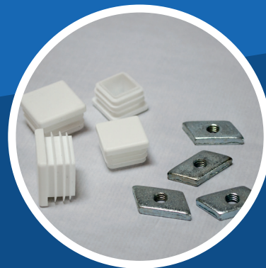
Fast and simple assembling